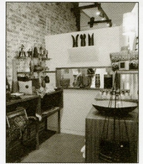
Members receive a 10% discount in the SFMC+D Museum Store!

The museum is recruiting docents for our next exhibition! If you would like to become a docent, contact us at 415.773.0303 or info@sfmcd.org .