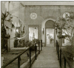
West Garden donated anonymously in memory of Sue Hamamjian.