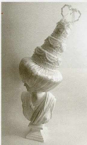
Kate Cusack I Do Hairdo, 2005 plastic wrap