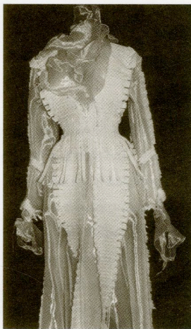
Swinda Reichelt Zipper Dress, 2005 mixed media